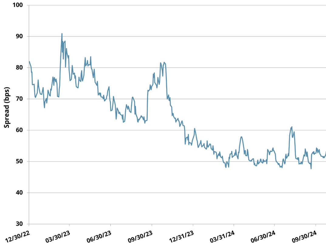
Figure 3: 5-Year IG CDX Index Credit Spreads